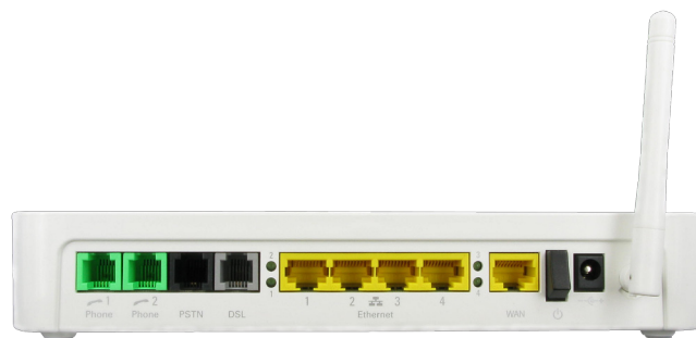
TG784 back panel

*** DLNA™ and DLNA™ Certified are registered trademarks of the Digital Living Network Alliance.